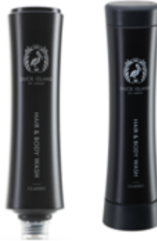
HAIR & BODY WASH 450ML BOTTLE Shown in wall mounted bracket (right), available separately CODE: C/HBW450