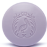
20G SOAP CODE: P/S20