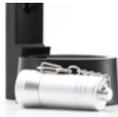
MAGNETIC SECURITY KEY FOR DISPENSER BRACKET CODE: D DM