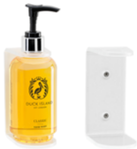
SINGLE TRANSPARENT ACRYLIC BRACKET, FOR 1 X 250ML BOTTLE (Bottle not included) CODE: D1WMA8

TRANSPARENT ACRYLIC. FITS ALL DUCK ISLAND 250ML BOTTLES