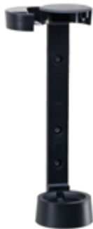
WALL MOUNTED DISPENSER BRACKET CODE: D DB