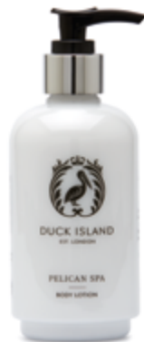
BODY LOTION CODE: S/BL250