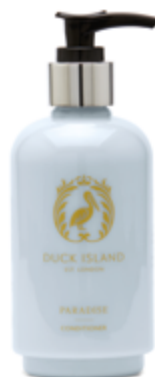
CONDITIONER CODE: P/C250