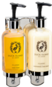
DOUBLE BRACKET, FOR 2 X 250ML BOTTLES (Bottles not included) CODE: D2WMSB

TRANSPARENT ACRYLIC. FITS ALL DUCK ISLAND 250ML BOTTLES