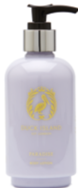
BODY LOTION CODE: P/BL250