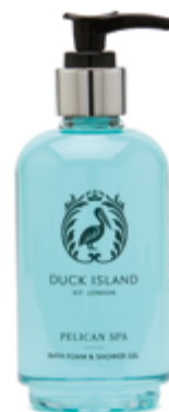
BATH FOAM & SHOWER GEL CODE: S/BFSG250