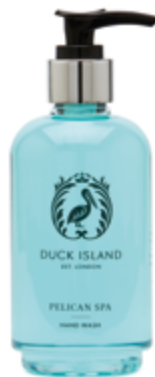
HAND WASH CODE: S/HW250