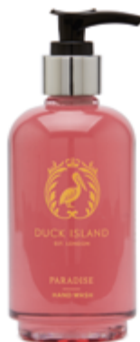
HAND WASH CODE: P/HW250