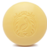
20G SOAP CODE: C/S20