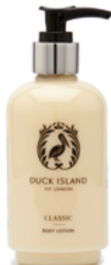
BODY LOTION CODE: C/BL250