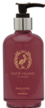
SHAMPOO CODE: P/SH250

ALL 250ML BOTTLES ARE REFILLABLE FROM OUR 5 LITRE CONTAINERS FOR REPEATED USE