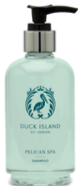
SHAMPOO CODE: S/SH250

ALL 250ML BOTTLES ARE REFILLABLE FROM OUR 5 LITRE CONTAINERS FOR REPEATED USE