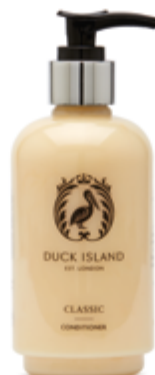
CONDITIONER CODE: C/C250