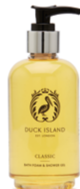
BATH FOAM & SHOWER GEL CODE: C/BFSG250