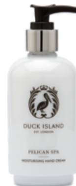
MOISTURISING HAND CREAM CODE: S/MHC250