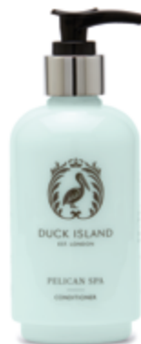
CONDITIONER CODE: S/C250