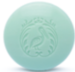
20G SOAP CODE: S/S20