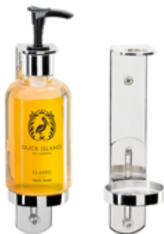
SINGLE BRACKET, FOR 1 X 250ML BOTTLE (Bottle not included) CODE: D1WMSB

STAINLESS STEEL. FITS ALL DUCK ISLAND 250ML BOTTLES