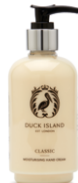
MOISTURISING HAND CREAM CODE: C/MHC250