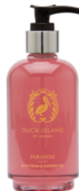
BATH FOAM & SHOWER GEL CODE: P/BFG250