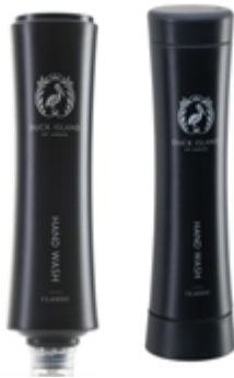
HAND WASH 450ML BOTTLE Shown in wall mounted bracket (right), available separately CODE: C/HW450