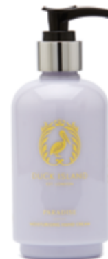
MOISTURISING HAND CREAM CODE: P/MHC250