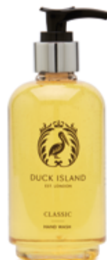
HAND WASH CODE: C/HW250