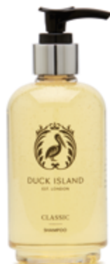
SHAMPOO CODE: C/SH250

ALL 250ML BOTTLES ARE REFILLABLE FROM OUR 5 LITRE CONTAINERS FOR REPEATED USE