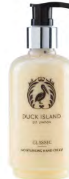
MOISTURISING HAND CREAM CODE: C/MHC250