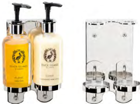
DOUBLE BRACKET, FOR 2 X 250ML BOTTLES (Bottles not included) CODE: D2WMSB

TRANSPARENT ACRYLIC. FITS ALL DUCK ISLAND 250ML BOTTLES