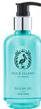
HAND WASH CODE: S/HW250