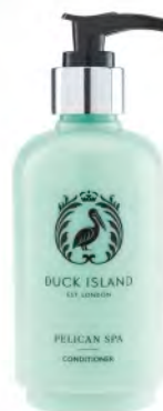
CONDITIONER CODE: S/C250