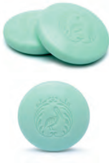
20G SOAP CODE: S/S20