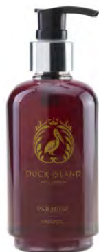
SHAMPOO CODE: P/SH250