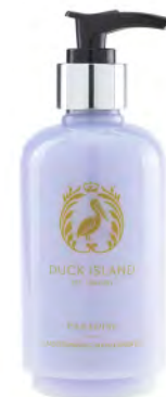
MOISTURISING HAND CREAM CODE: P/MHC250