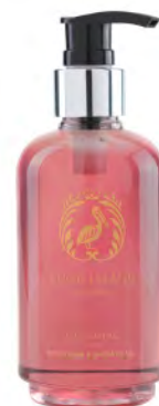
BATH FOAM & SHOWER GEL CODE: P/BFG250