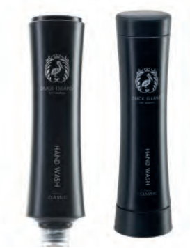
HAND WASH 450ML BOTTLE Shown in wall mounted bracket (right), available separately CODE: C/HW450