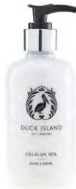
BODY LOTION CODE: S/BL250