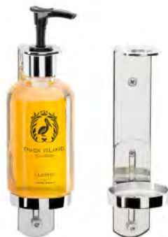
SINGLE BRACKET, FOR 1 X 250ML BOTTLE (Bottle not included) CODE: D1WMSB

STAINLESS STEEL. FITS ALL DUCK ISLAND 250ML BOTTLES