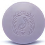
20G SOAP CODE: P/S20