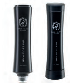
HAIR & BODY WASH 450ML BOTTLE Shown in wall mounted bracket (right), available separately CODE: C/HBW450