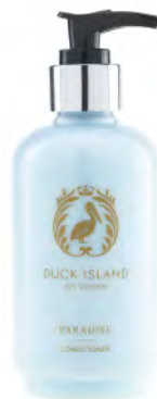
CONDITIONER CODE: P/C250