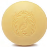
20G SOAP CODE: C/S20

WITH EASY-FILL PUMP FOR FAST AND EFFICIENT REFILLING OF 250ML AND 30ML BOTTLES