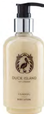
BODY LOTION CODE: C/BL250