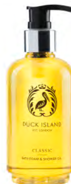
BATH FOAM & SHOWER GEL CODE: C/BFSG250