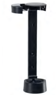
WALL MOUNTED DISPENSER BRACKET CODE: D DB