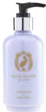
BODY LOTION CODE: P/BL250