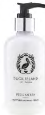
MOISTURISING HAND CREAM CODE: S/MHC250