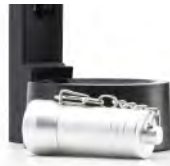
MAGNETIC SECURITY KEY FOR DISPENSER BRACKET CODE: D DM