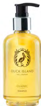
SHAMPOO CODE: C/SH250