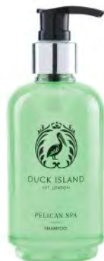
SHAMPOO CODE: S/SH250