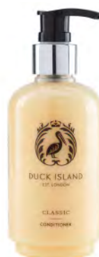
CONDITIONER CODE: C/C250