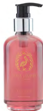
HAND WASH CODE: P/HW250