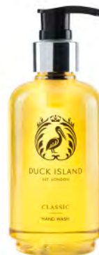
HAND WASH CODE: C/HW250