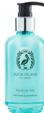
BATH FOAM & SHOWER GEL CODE: S/BFSG250