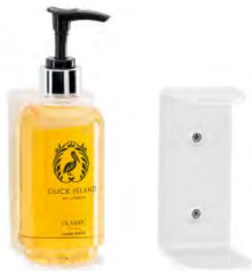
SINGLE TRANSPARENT ACRYLIC BRACKET, FOR 1 X 250ML BOTTLE (Bottle not included) CODE: D1WMA8

TRANSPARENT ACRYLIC. FITS ALL DUCK ISLAND 250ML BOTTLES