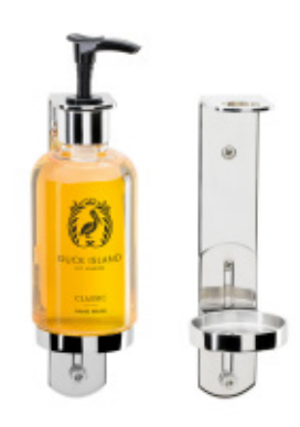
SINGLE BRACKET, FOR 1 X 250ML BOTTLE (Bottle not included) CODE: DIWMSB

STAINLESS STEEL, FITS ALL DUCK ISLAND 250ML BOTTLES