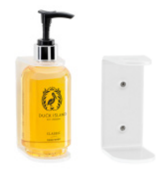
SINGLE TRANSPARENT ACRYLIC BRACKET, FOR 1 X 250ML BOTTLE (Bottle not included) CODE: DIWMAB

TRANSPARENT ACRYLIC. FITS ALL DUCK ISLAND 250ML BOTTLES